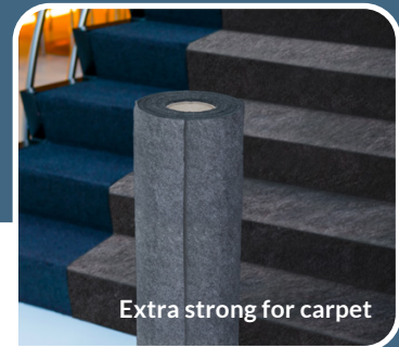
Extra strong for carpet

1m x 50m # 900014 | 0,65m x 50m # 900013