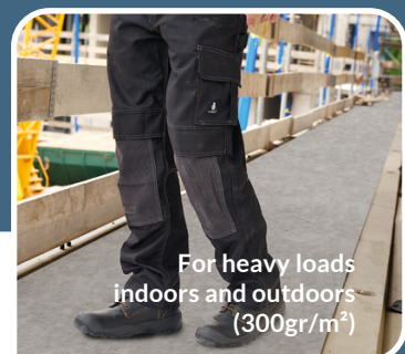
For heavy loads indoors and outdoors (300gr/m 2 )