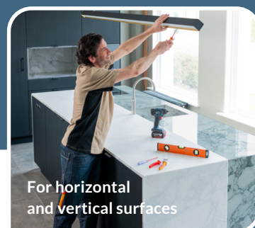
For horizontal and vertical surfaces