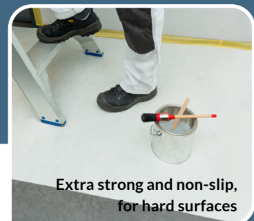
Extra strong and non-slip, for hard surfaces