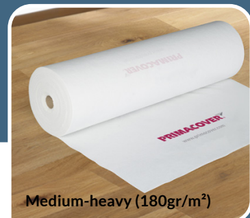
Medium-heavy (180gr/m 2 )

2m x 50m # 900031 | 1m x 50m # 900030 | 1m x 25m #900032 | 0,65m x 25m # 900033