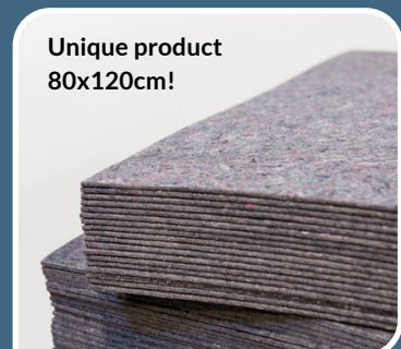
Unique product 80x120cm!