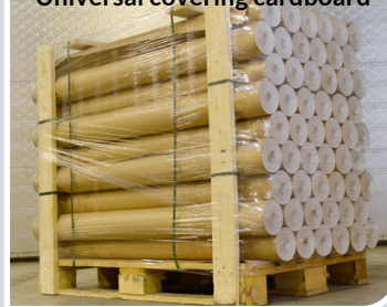
Universal covering cardboard

50m 2 ±130cm 150-200gr/m 2 # 900092 | 50m 2 ±70cm 150-200gr/m 2 # 900633