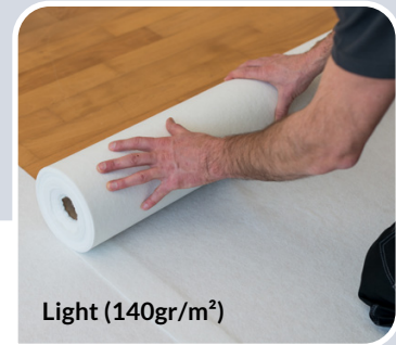
Light (140gr/m 2 )

2m x 50m # 900010 | 1m x 50m # 900271 | 1m x 25m #900275 | 0,65m x 25m # 900276