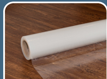
For hard surfaces